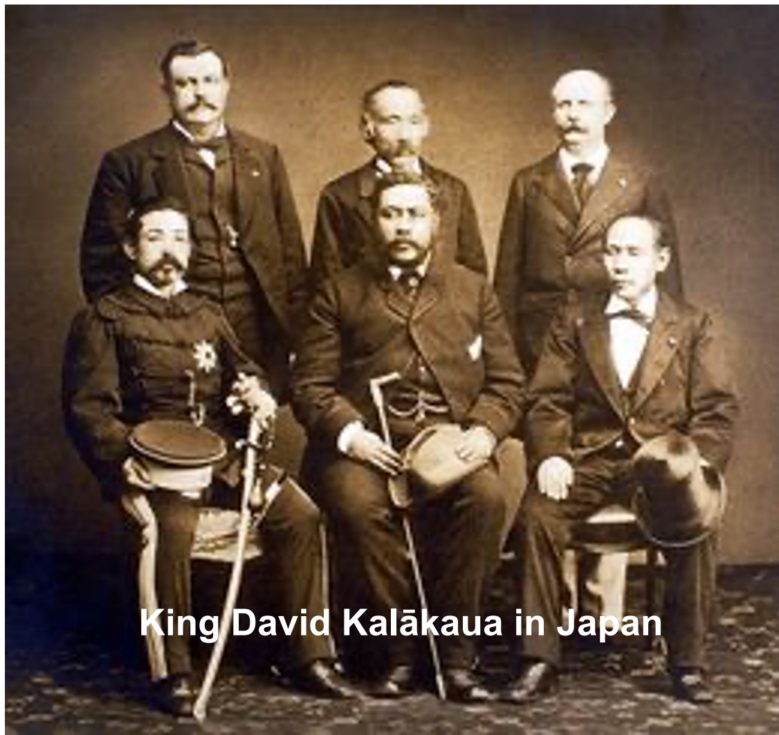
King David Kalākaua in Japan